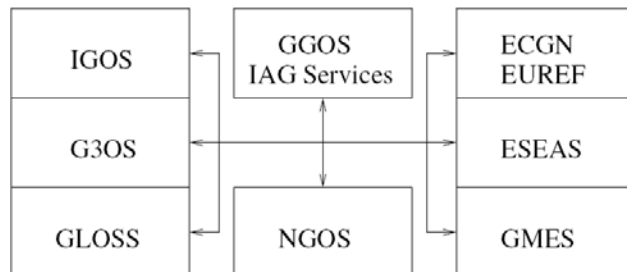
Figure 1. Relations of NGOS to other activities.

ECGN: European Combined Geodetic Network; ESEAS: European Sea-Level Service; EUREF: Reference frame subcommission for Europe; G3OS: Global Observing Systems; GGOS: Global Geodetic Observing System; GMES: Global Monitoring for Environment and Security; IAG: International Association of Geodesy; IGOS: Integrated Global Observing Strategy; NGOS: Nordic Geodetic Observing System.