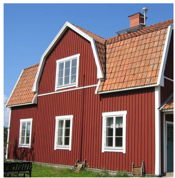
Figure 3.2: Söderboda is a SWEPOS station with a roof-mounted GNSS antenna mainly established for network RTK purposes belonging to class B.

The class A stations are built on bedrock and have redundant equipment for GNSS observations, communications, power supply, etc. They have also been connected by precise levelling to the national precise levelling network. Class B stations are mainly established on top of buildings for network RTK purposes. They have the same instrumentation as class A stations (dual-frequency multi-GNSS receivers with antennas of Dorne Margolin choke ring design), but with somewhat less redundancy.