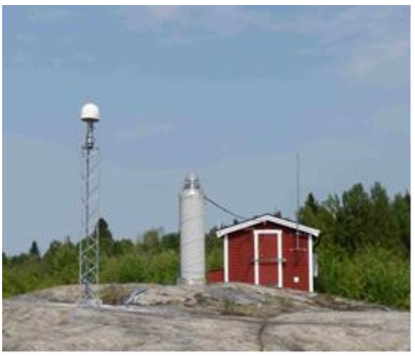
Figure 3.1: Hässleholm is one of the SWEPOS stations belonging to class A. It has both a new monument (established in 2011) and an old monument (from 1993).

By the time for the EUREF Symposium in June 2015 SWEPOS consisted of totally 355 stations, 38 class A stations and 317 class B ones, see Figures 3.1 and 3.2. This means that the total number of SWEPOS stations has increased with 46 stations since the previous EUREF Symposium one year ago, see Figure 3.3.