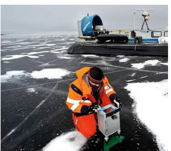
Figure 7.1: Relative gravity measurements in March 2011 on Lake Vänern, the largest lake in Sweden.

According to Geodesy 2010, the ultimate goal is to compute a 5 mm (68 %) geoid model by 2020. To reach this goal – to the extent that it is realistic – work is going on to establish a new gravity network/system as well as to improve the Swedish detail gravity data by new gravity measurements. One region where such measurements have been performed is on Lake Vänern (Ågren et al., 2014a), see Figure 7.1.