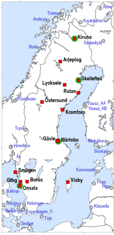
Figure 8.1: The 14 absolute gravity sites in Sweden (red squares) and sites in neighbouring countries (grey circles). The four sites with time series more than 15 years long have a green circle as background to the red square.

Absolute gravity observations have been carried out at 14 Swedish sites since the beginning of the 1990's, see Figure 8.1. All sites, except for Göteborg (Gtbg) which no longer is in use, have been observed by Lantmäteriet since 2007. The observations have been carried out with an absolute gravimeter (Micro-g LaCoste FG5 - 233), which Lantmäteriet purchased in the autumn of 2006. The objective behind the investment was to ensure and strengthen the observing capability for long-term monitoring of the changes in the gravity field due to the Fennoscandian GIA<sup>17</sup>.