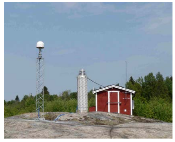
Figure 2: The SWEPOS station Hässleholm with the new monument (established in 2011) and the old monument (established in 1993).

The SWEPOS Network RTK Service reached national coverage during 2010. Since data from permanent GNSS stations are exchanged between the Nordic countries, good coverage of the service in border areas and along the coasts has been obtained by the inclusion of 20 Norwegian SATREF stations, 5 Finnish Geotrim stations, 3 Danish Leica SmartNet stations and 2 Danish Geodatastyrelsen (Danish Geodata Agency) stations.