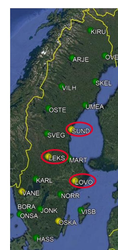
Figure 6. The masts spring 2023.