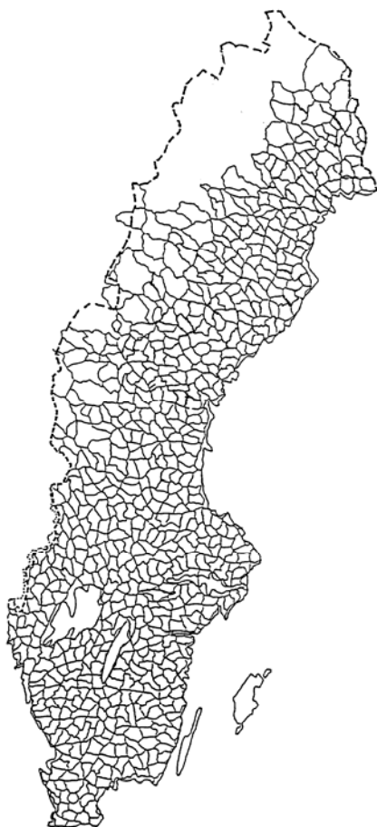
Fig. 1: The net configuration of the third precise levelling.

The third precise levelling of Sweden is progressing according to plan. It started in 1979 and the levellings are planned to be finished in the few coming years. The final network will consist of about 50 000 bench marks representing roughly 50 000 km double run precise levelling. The levellings have now reached the most northern parts of Sweden, see figure 1. Due to weather conditions the levelling season is limited from the end of May to the beginning of October.