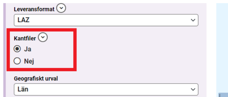
Figure 3. Example of how borders are included in the delivery

Borders can be important for certain applications, for example, they provide a means of smoothing out differences between adjacent scan areas.